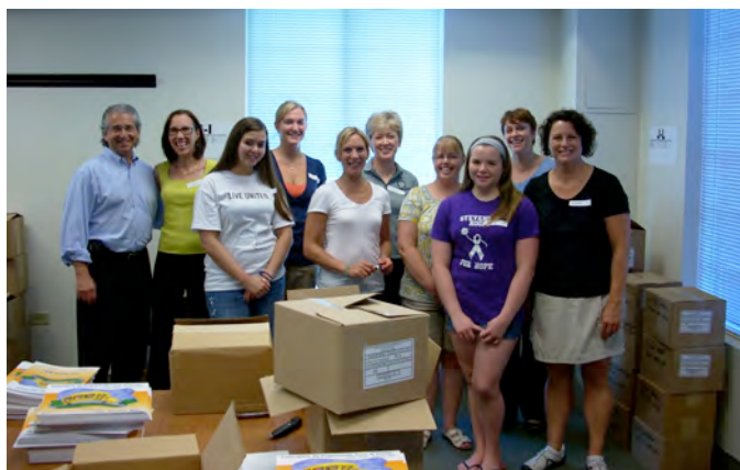
Kindergarten Readiness Calendars and Workbooks..

“We try to take good care of our things so my one year-old can use them as he grows!”